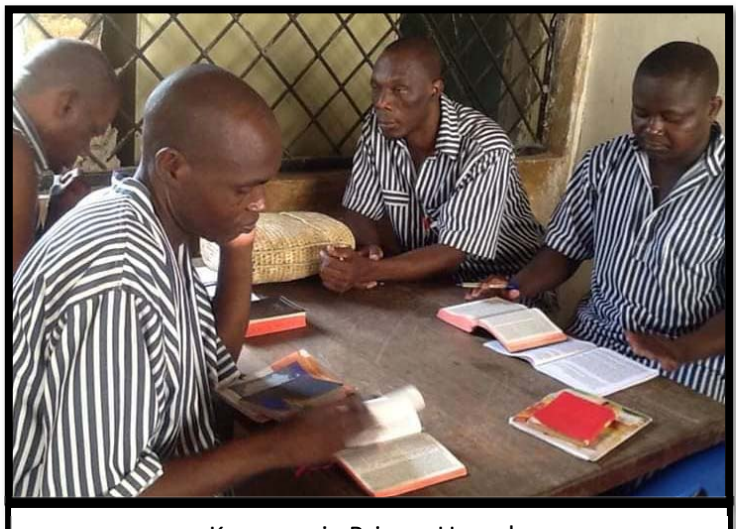
Kapengaria Prison, Uganda

Imagine with your busy schedule, no crowded stores or finding the item you purchased to be the wrong size. Instead, in the name of a loved one or an entire family, you can give a gift that is always just the right size, a Bible Gift Set. With a $10.50 donation to the Africa Bible Project you can put a Bible and Discipleship Booklet into the hands of villagers and prisoners in the Great Lakes Region of Africa.